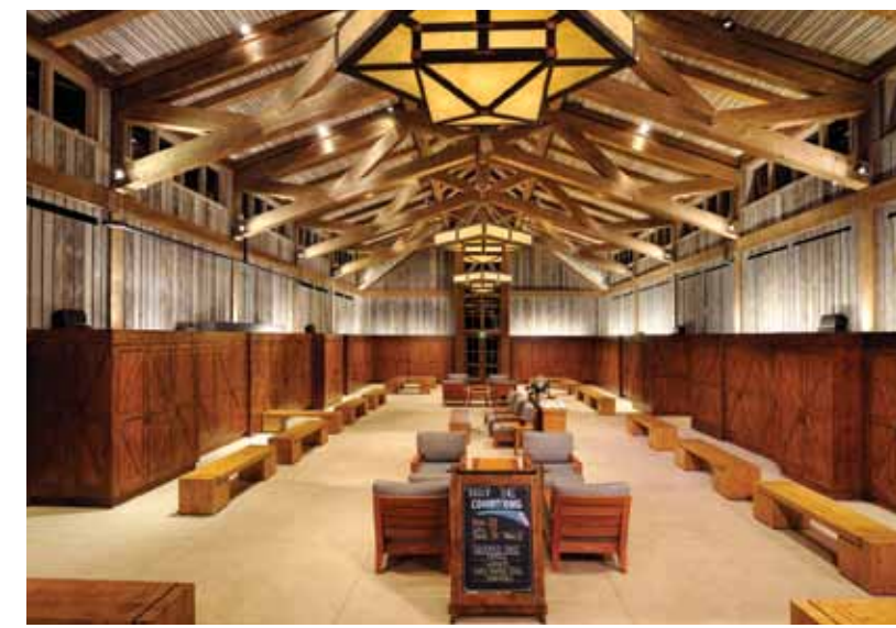
The Alpine Barn offers ski and snowboard storage, spacious lockers with boot driers, a ski concierge, and a shuttle to take you directly to the slopes.