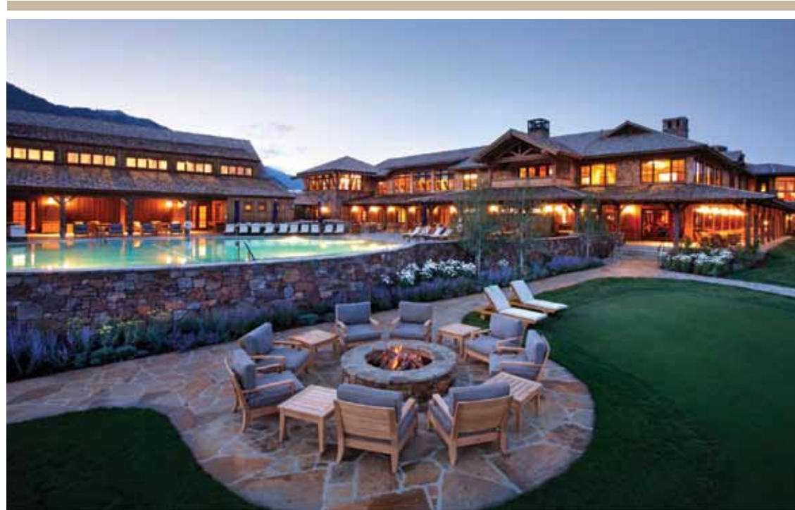
At dusk, Alpine Barn, pool, clubhouse, and fire pit.