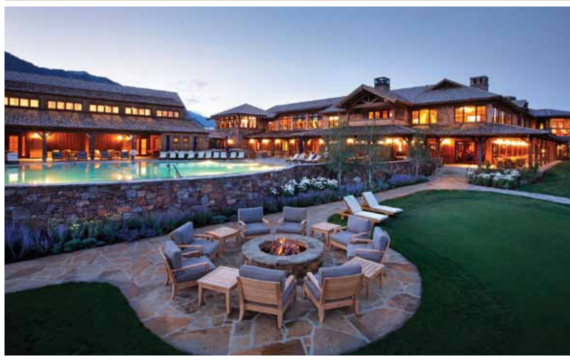
At dusk, Alpine Barn, pool, clubhouse, and fire pit.