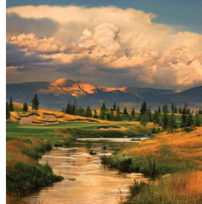
With the Sleeping Indian in the background, Hole 17 is a par 3 that follows the creek to a well protected green. Five strategically placed tee boxes offer challenges to players of all ability levels.

"At Shooting Star, we created drama for the golfer, while ensuring that the course fits its natural setting."