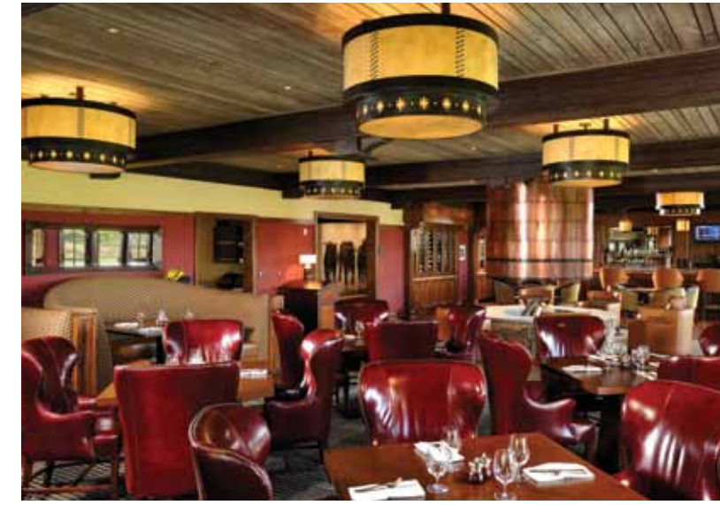
The dining room with a circular fireplace and copper bar.