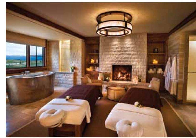
The Couples Suite in the Spa at Shooting Star.