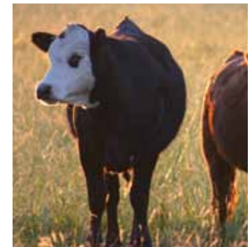
Moving cattle on the Snake River Ranch with the Grand Teton as a backdrop.

Shooting Star was planned with mechanisms to complement Snake River Ranch as a working cattle ranch and with further enhancements to Fish Creek and its wildlife habitat.