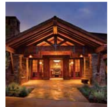
View of the Shooting Star Golf Course, the West Gros Ventre Butte, and the Snake River Range from the Clubhouse

Working with some of the valley's largest cattle ranches, the Land Trust has helped preserve the entire 1,800-acre Walton Ranch and parts of the Hansen Ranch and Snake River Ranch. All told, the Land Trust has permanently protected over 21,000 acres in and around Jackson Hole. Through its support of local organizations, the Community Foundation has helped make Jackson Hole the most philanthropic community in the U.S. on a per capita basis. Out of about 20,000 residents, over 3,000 participate in the Community Foundation's annual fundraising event, which has raised more than $67 million for local non profits in the last thirteen years.