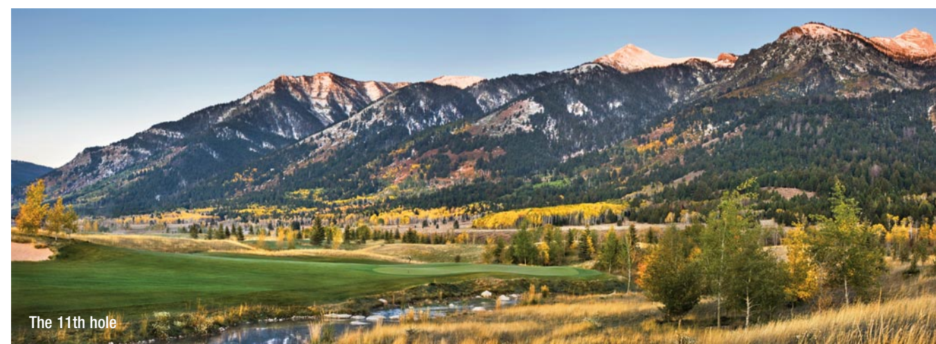
The 11th hole

PUTTING GREENS GO INTO HIBERNATION DURING WINTER, BUT BENT GRASS STILL PRODUCES A SMALL AMOUNT OF BYPRODUCT GASES. IF THE GREENS ARE COVERED IN AN ICE SHEET FOR MORE THAN 120 DAYS, THE BUILDUP OF GASES CAN BE PROBLEMATIC. MOST GOLF COURSE SUPERINTENDENTS WILL REMOVE SNOW AND ICE COVER IN LATE WINTER AND OFTEN COVER THE GREENS WITH A COATING OF BLACK SAND TO AID MELT-OFF.