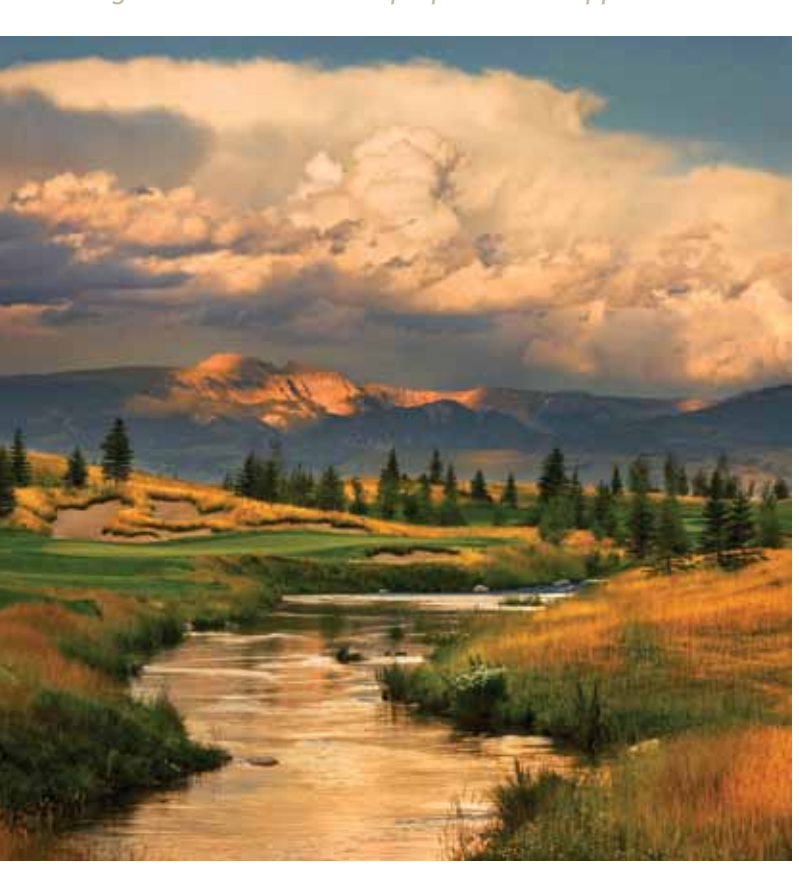
With the Sleeping Indian in the background, Hole 17 is a par 3 that follows the creek to a well protected green. Five strategically placed tee boxes offer challenges to players of all ability levels.