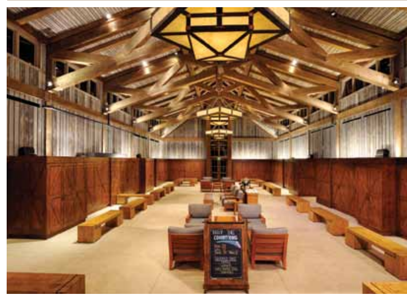
The Alpine Barn offers ski and snowboard storage, spacious lockers with boot driers, a ski concierge, and a shuttle to take you directly to the slopes.