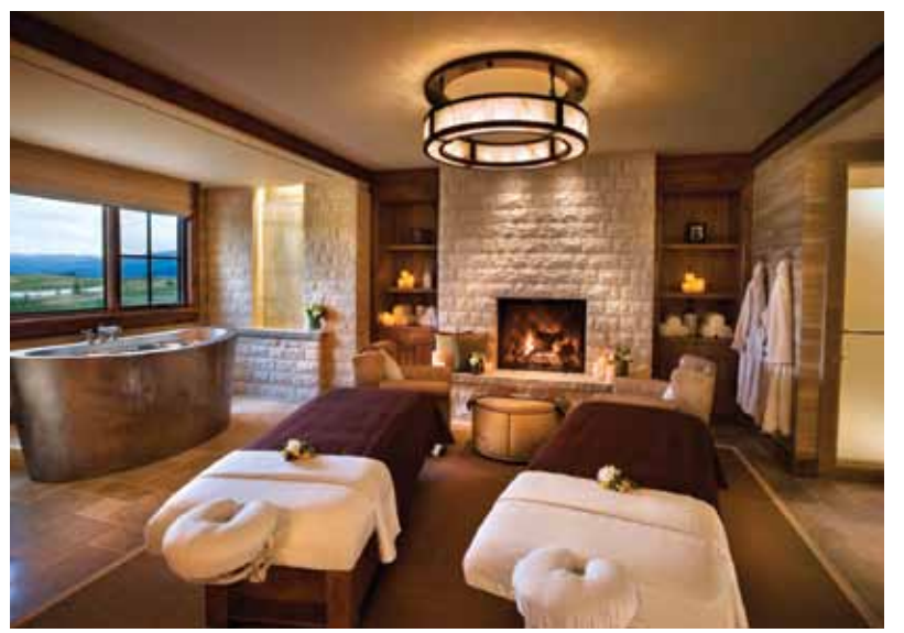
The Couples Suite in the Spa at Shooting Star.