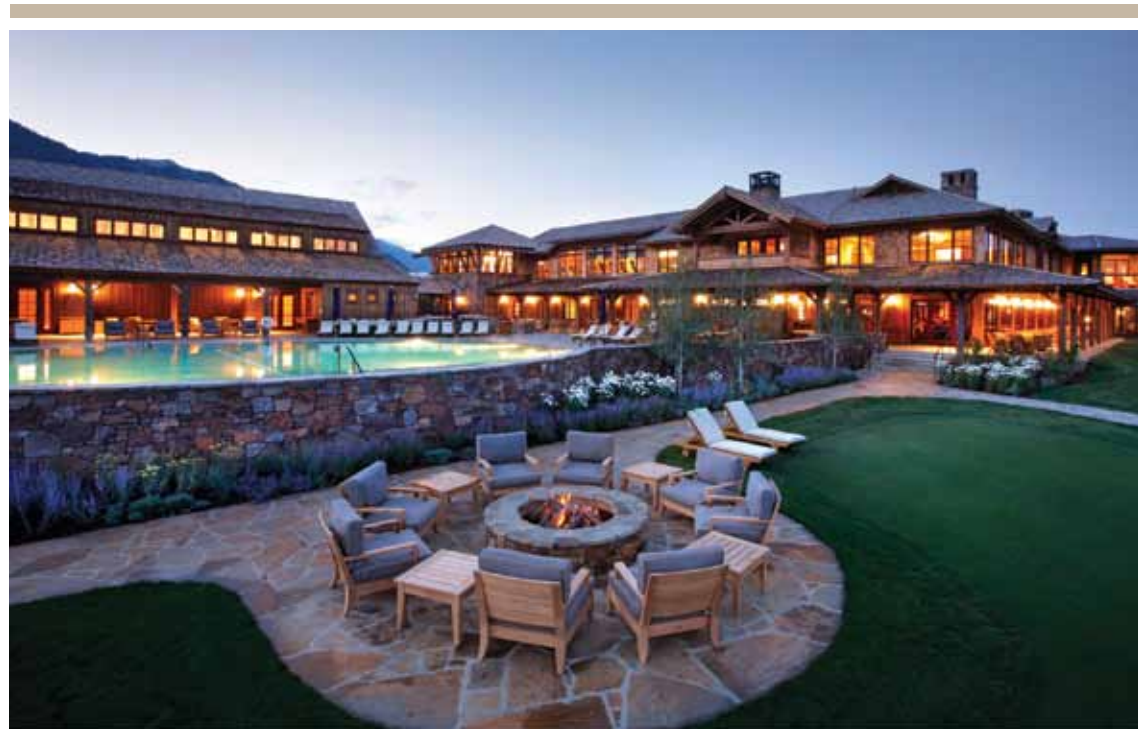
At dusk, Alpine Barn, pool, clubhouse, and fire pit.