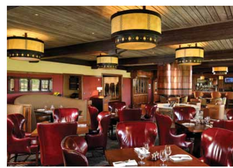
The dining room with a circular fireplace and copper bar.